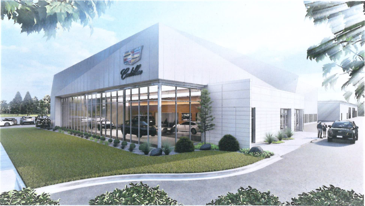
EXHIBIT B-2 DEPICTION OF THE PROJECT