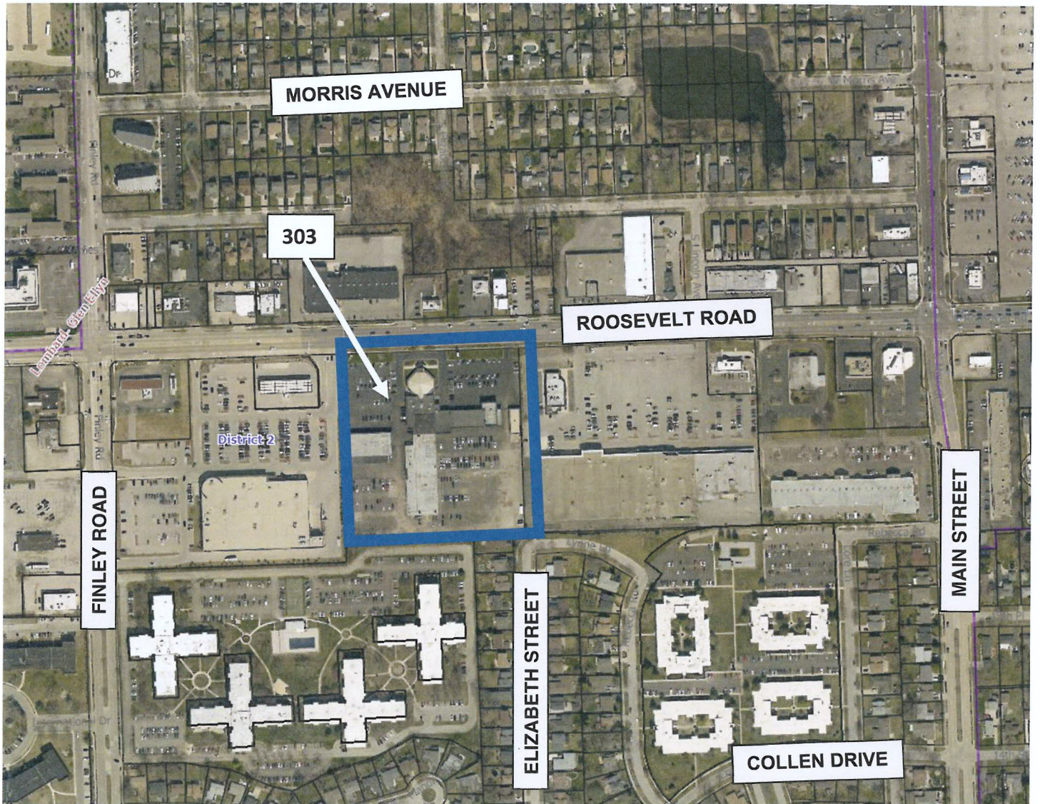
EXHIBIT A-2 DEPICTION OF THE SUBJECT PROPERTY

HERITAGE CADILLAC DEALERSHIP 303 W ROOSEVELT ROAD