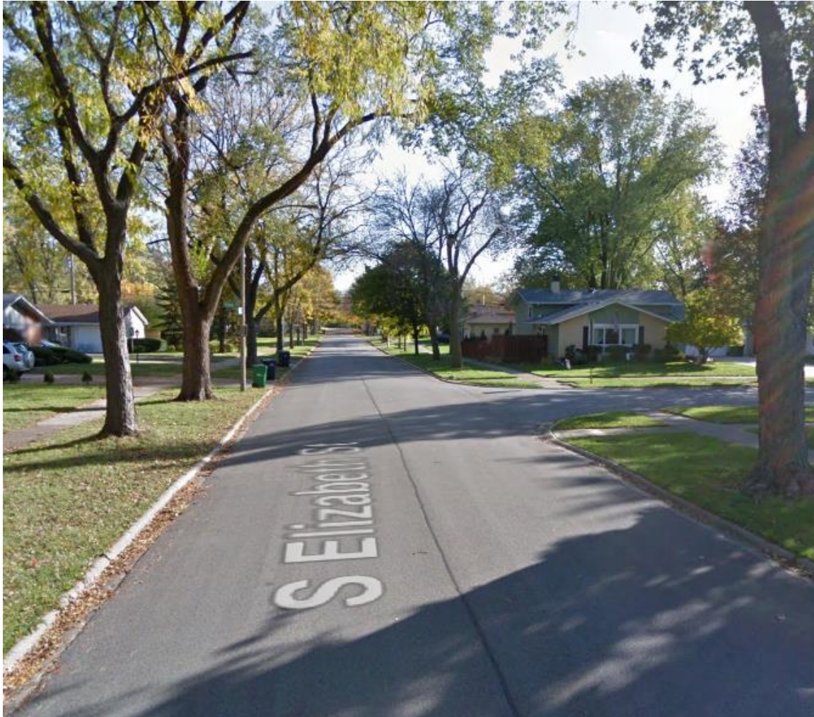
SOUTHBOUND S. ELIZABETH ST APPROACHING EDSON PL.