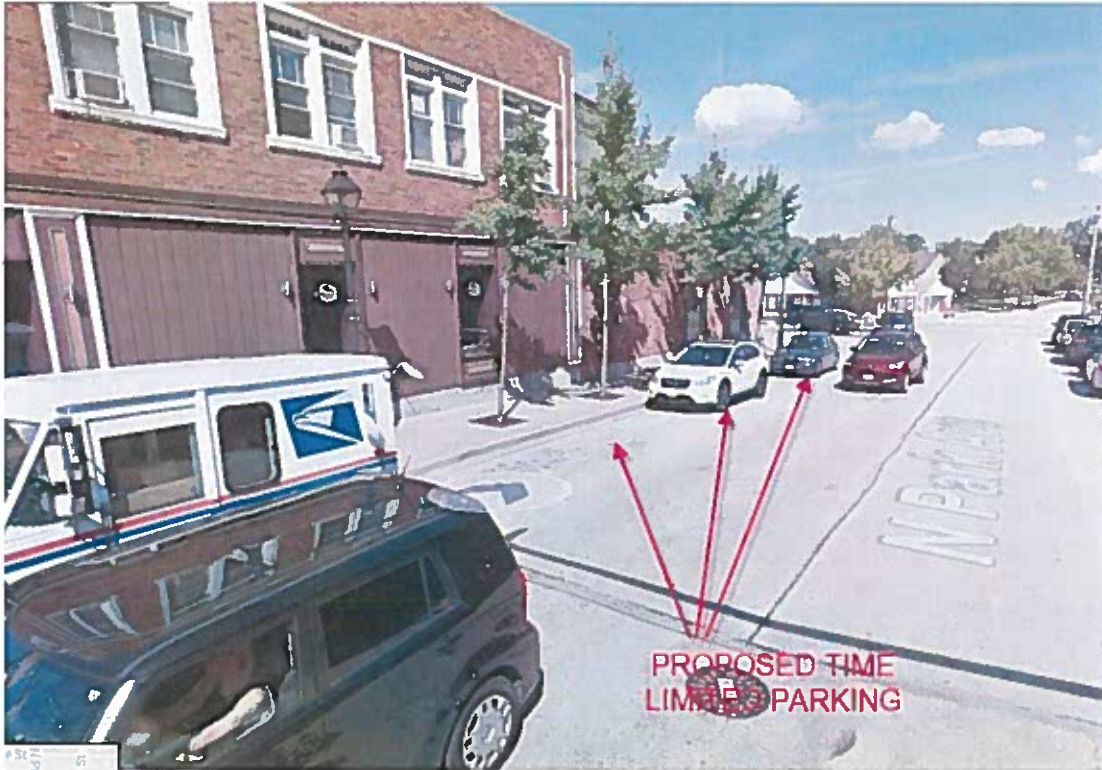
PARK AVE WEST SIDE PARKING