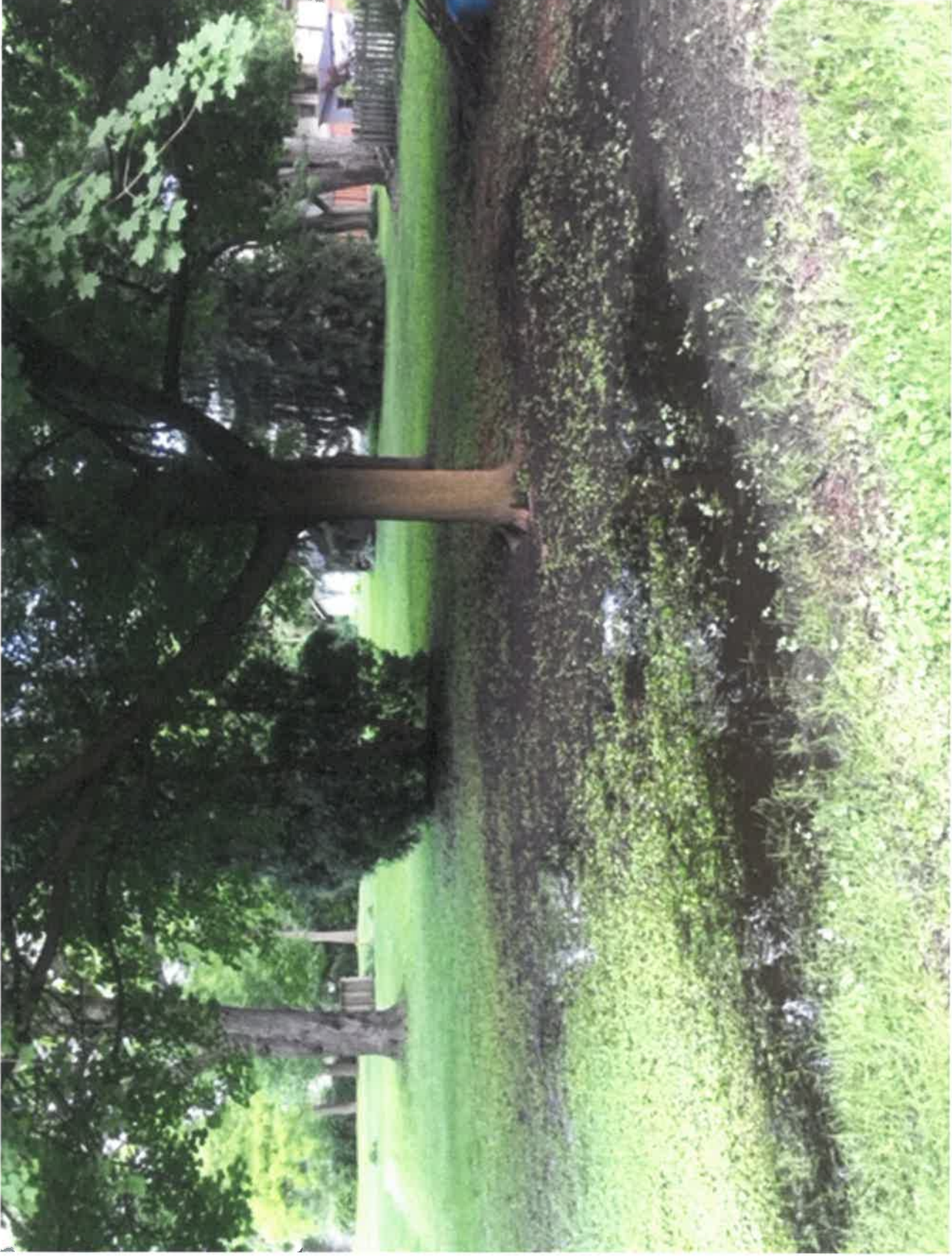
Photo 4A - June 27, 2018 - This photo shows standing water four days later in the backyard of 130 W. Grove, closer to the house.