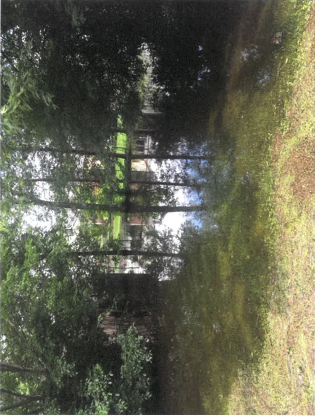
Photo 2 - June 23, 2018 - This photo shows standing water in the backyard of 134 W. Grove St., 139 W. Windsor and 135 W. Windsor.