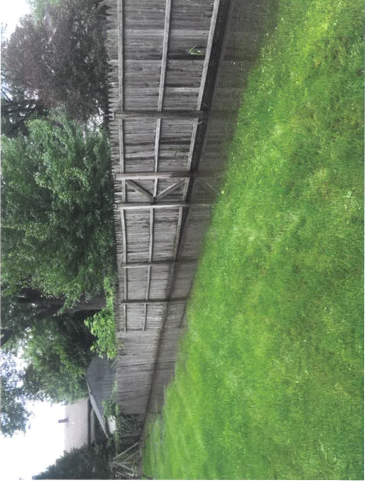
Photo 5 - June 23, 2018 - This photo shows standing water on the west side of the backyard of 134 W. Grove Street. The properties with standing water on the other side of the fence include; 138 W. Grove Street, 121 N. Lincoln and 125 N. Lincoln.