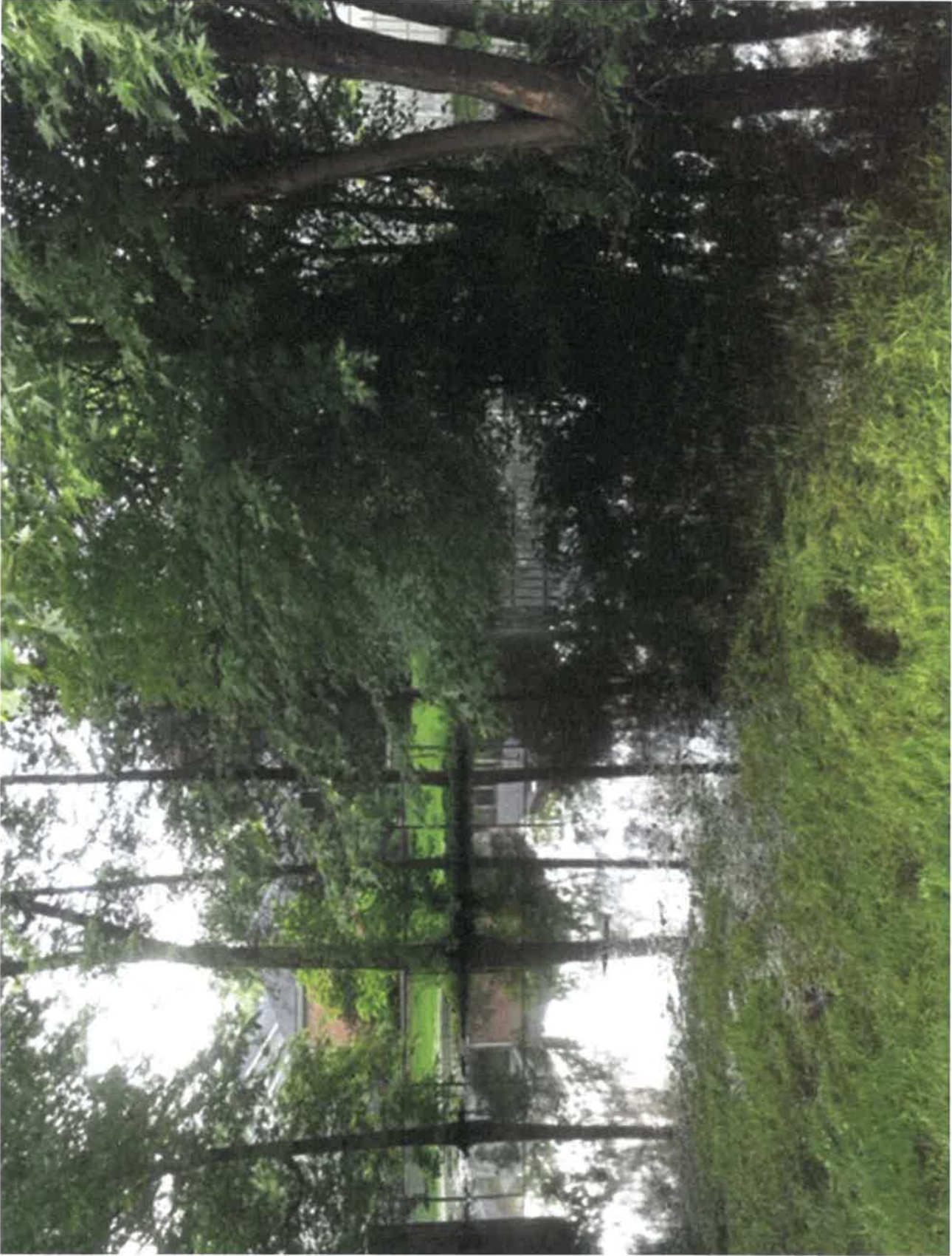
Photo 2A - June 27, 2018 - This photo shows standing water four days later in the backyards of 134 W. Grove St., 139 W. Windsor and 135 W. Windsor.