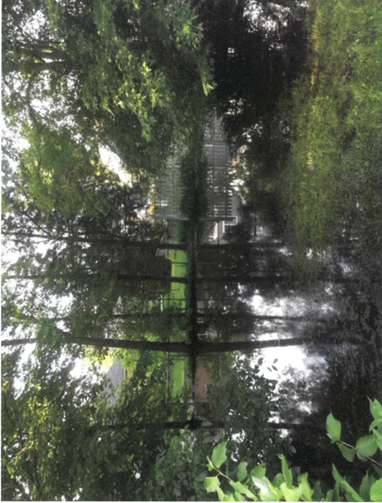
Photo 2B - June 27, 2018 - This photo shows standing water four days later in the backyards of 134 W. Grove St., and 135 W. Windsor.