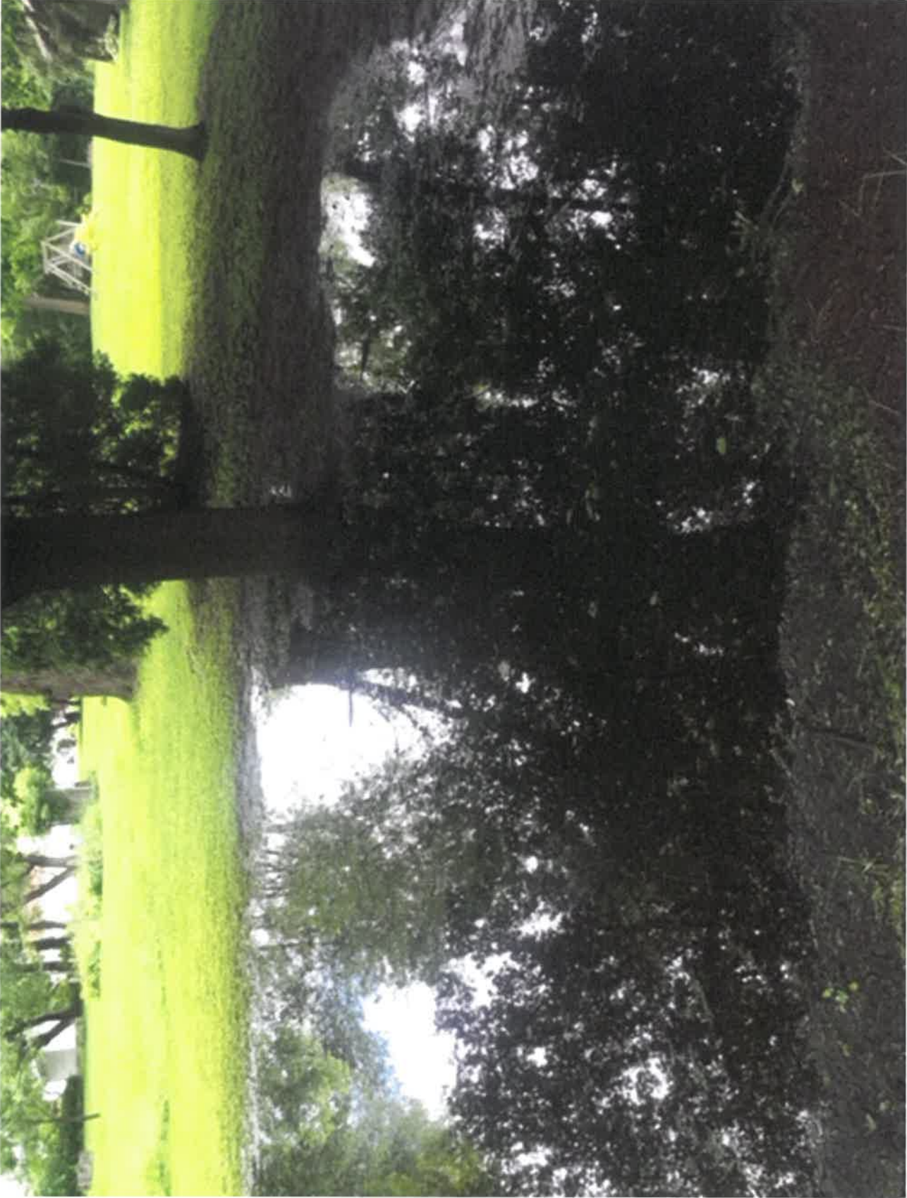
Photo 4 - June 23, 2018 - This photo shows standing water in the backyard of 130 W. Grove, closer to the house.