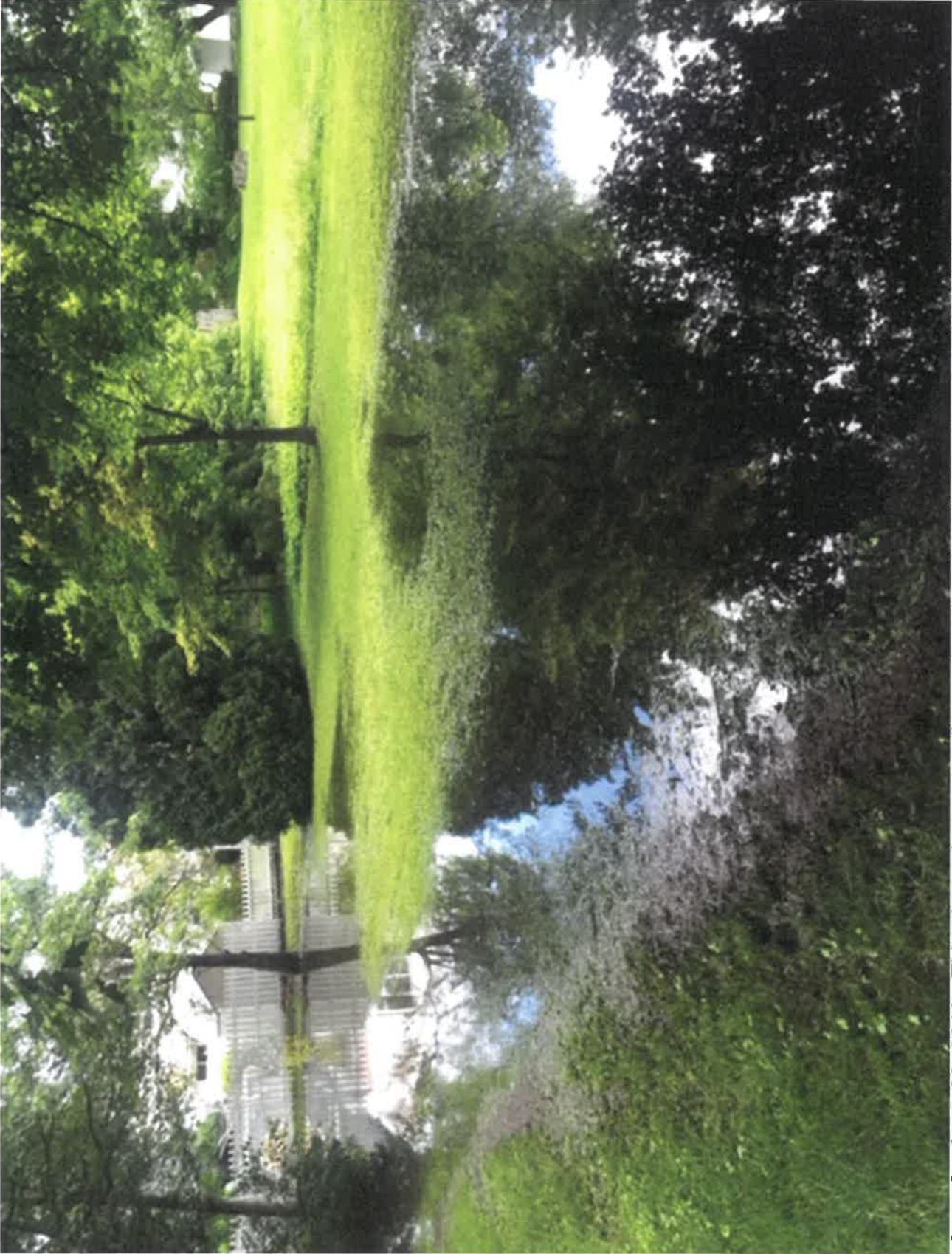
Photo 3 - June 23, 2018 - This photo shows standing water primarily in the backyard of 130 W. Grove St.