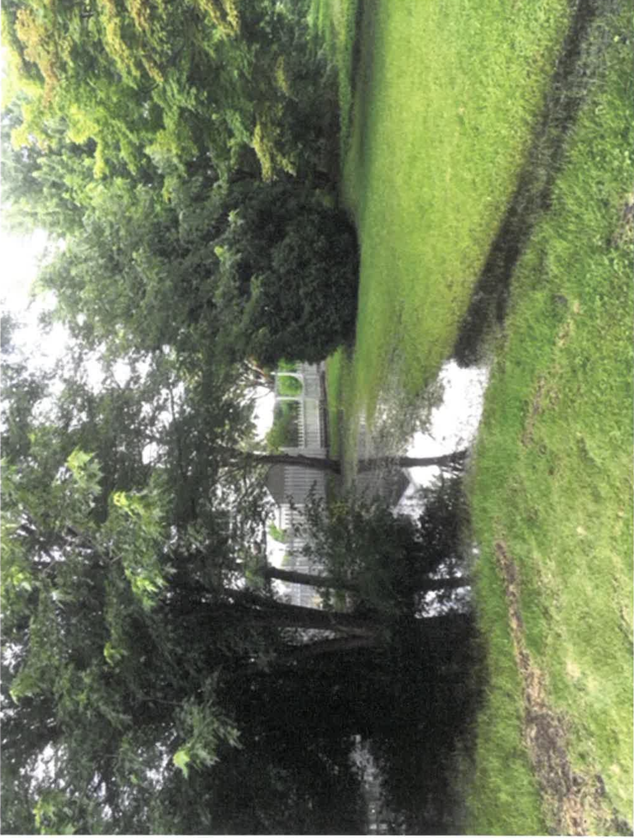
Photo 1A - June 27, 2018 - This photo shows standing water four days later in the backyards of 134 W. Grove, 130 W. Grove St., and 128 W. Grove Street. The properties on the other side of the fence are; 131 W. Windsor, 127 W. Windsor.