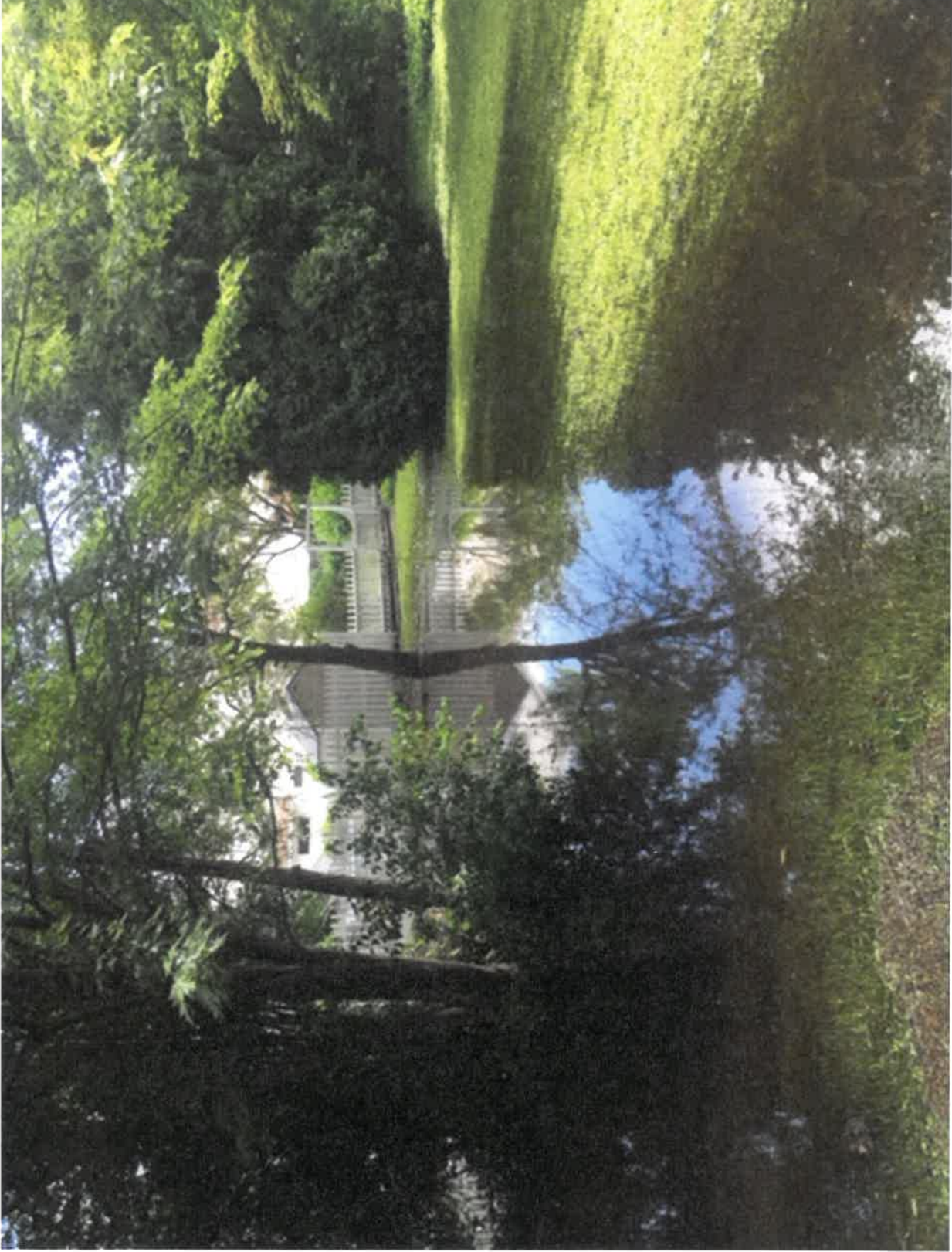
Photo 1 - June 23, 2018 - This photo shows standing water in the backyards of 134 W. Grove, 130 W. Grove St., and 128 W. Grove Street. The properties on the other side of the fence are; 131 W. Windsor, 127 W. Windsor.