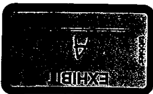
Exhibit A: Work to be Performed