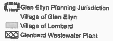
Exhibit A - Amended Boundary Line First Amendment to Boundary Line Agreement

Glenbard Wastewater First Amendment Change