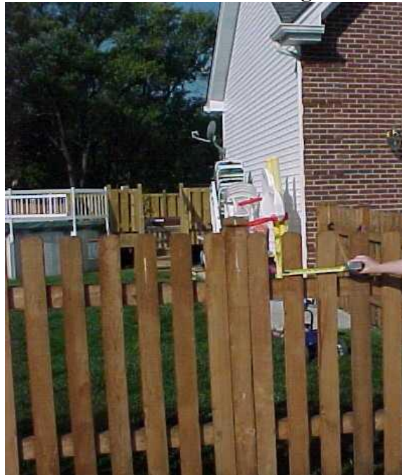
Fence in the Clear Line of Sight Area

Staff notes that a precedent has been set by the approval of a similar variation request less than two blocks away from the subject property (ZBA 02-04). Staff finds that the degree of non-conformity presented in ZBA 02-04 was greater than the non-conformity presented as part of this petition. In that case, the approved variation allowed the entire fence within the corner side yard to be a solid six-foot (6') fence. The variation request associated with this petition is to allow a ten-foot (10') portion of the fence to be six feet (6') in height. The remaining portion of the fence within the corner side yard meets the four-foot (4') maximum height requirement. Also, the portion within the clear line of sight area does have a degree of transparency to it in that there is spacing between the pickets. However, the spacing is not enough to meet the seventy-five percent (75%) open surface area requirement for fences within the clear line of sight area. The fence is approximately fifty percent (50%) open.