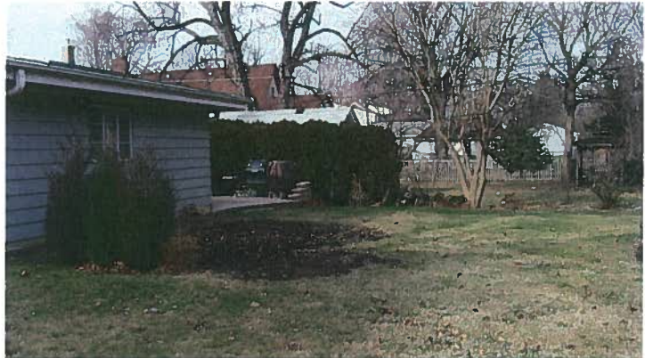
Petitioner's proposed site for the two and ½ car garage addition.

Staff finds that the conditions on the subject property are unique. The placement of the principal structure on a corner lot and wide parkway influence the petitioner's request to extend their property into the side and rear yard setbacks.