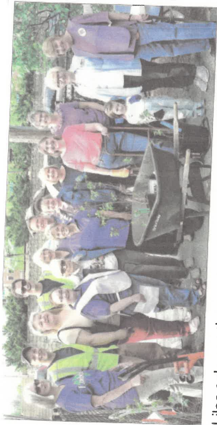
STEW SPODEN/PHOTO LOMBARD GARDEN CLUB