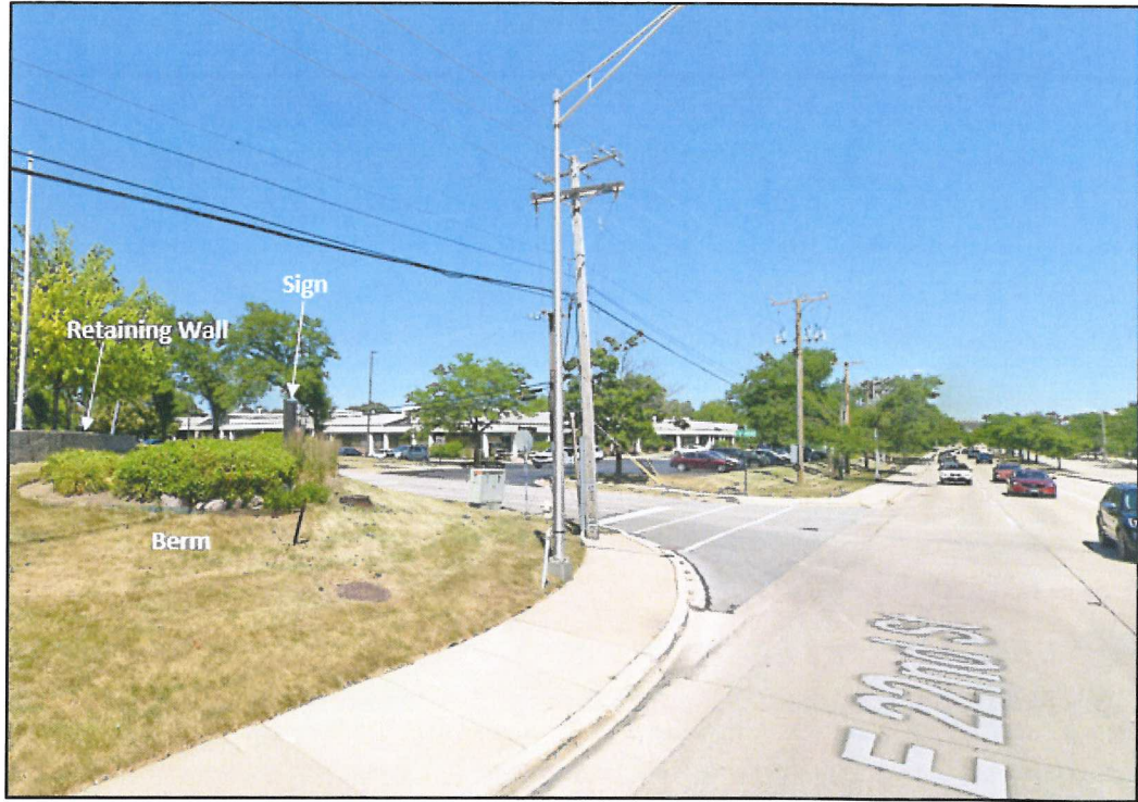
Figure 1. View of sign from 22 nd Street