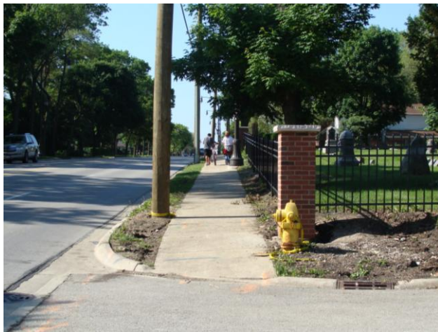
Looking South on Main St.: Pillar at northern intersection

As part of the replacement, six brick pillars were reconstructed at their original dimensions and locations. However, as these pillars were non-conforming structures, reconstruction would require that new pillars meet all code requirements. The new pillars are approximately nineteen and one half inches (19.5") in width with a stone cap at the top that is approximately two feet (2') in width. The Zoning Ordinance requires that supporting members of a fence within the clear line of sight area be no greater than six inches (6") in width. Two of the reconstructed pillars are within clear line of sight areas. These two pillars are located at the intersections of Washington Boulevard and Main Street, one at the northern intersection and one at the southern intersection. As the width of these pillars exceeds six inches (6"), a variation is necessary.