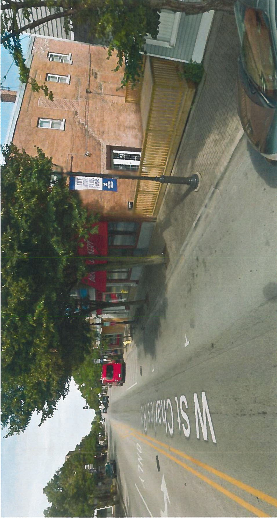
GOOGLE MAPS VIEW OF BALKAN BAKERY (RED AWNING) APPROACHING FROM THE EAST