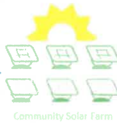
Community Solar Farm