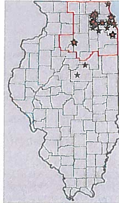
2008 EAB Quarantine per IDOA: