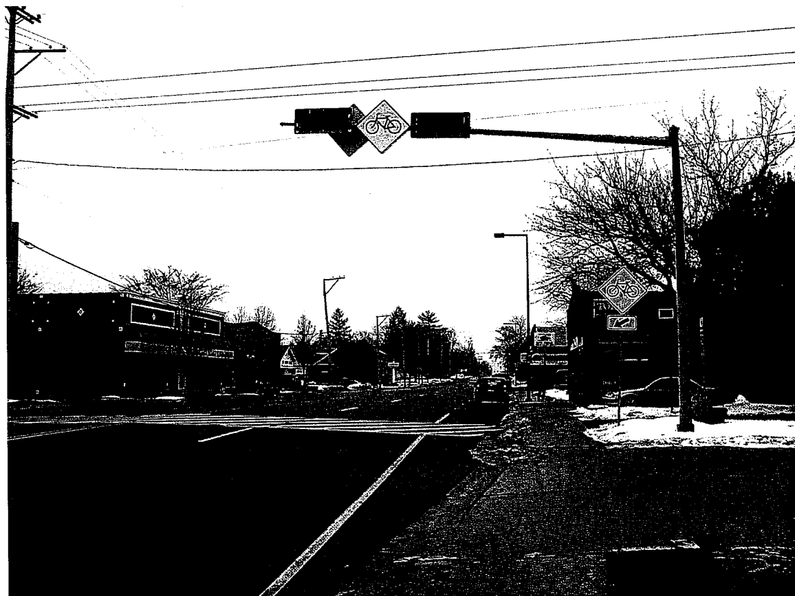
Westmore Road – looking south – Proposed Condition