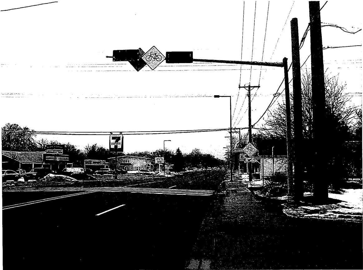
Westmore Road – looking north – Proposed Condition