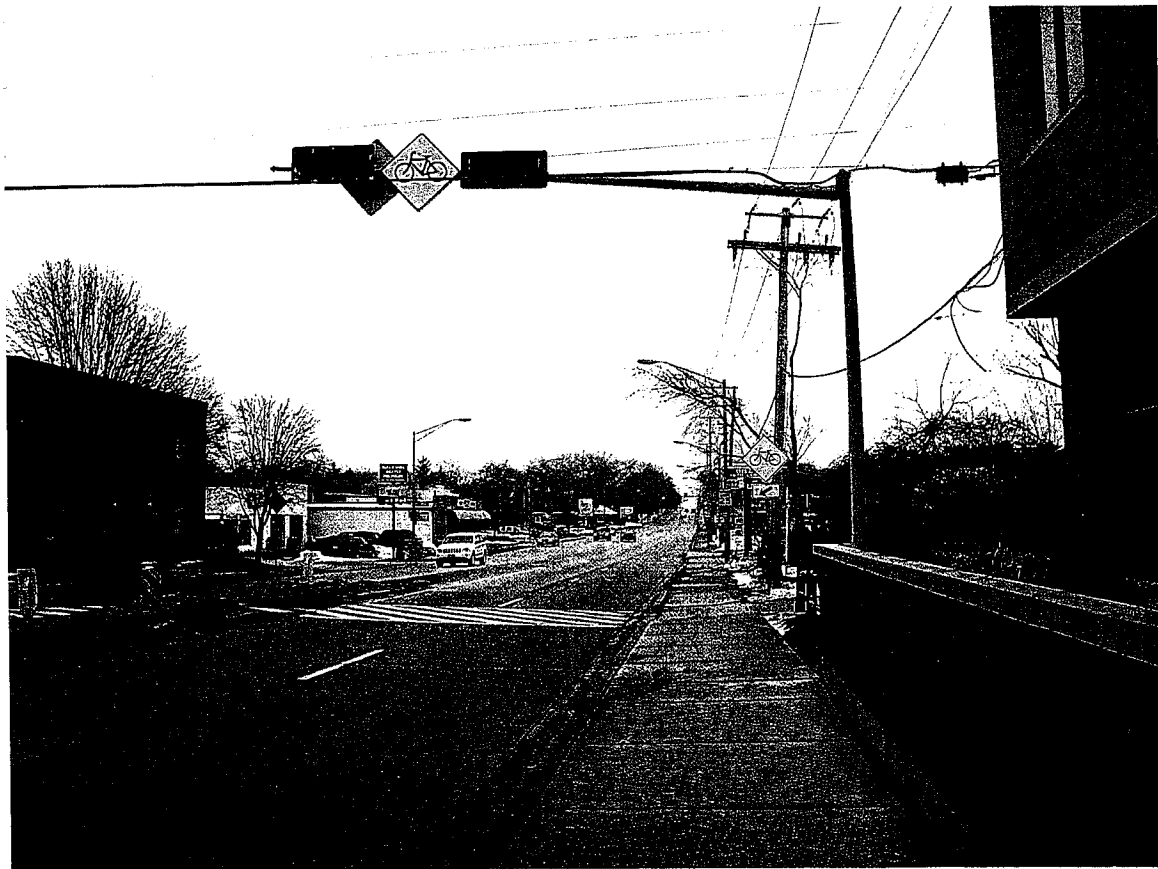
Main Street – looking south – Proposed Condition