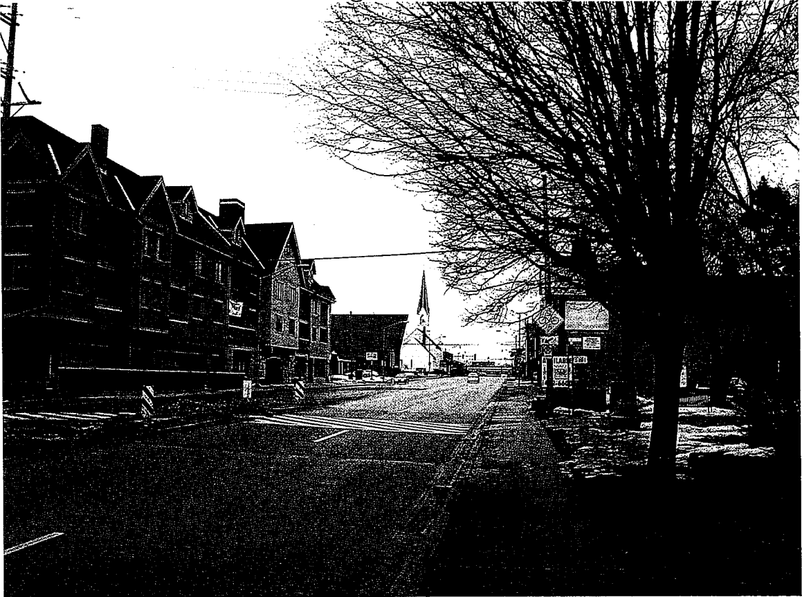
Main Street – looking north – Existing Condition