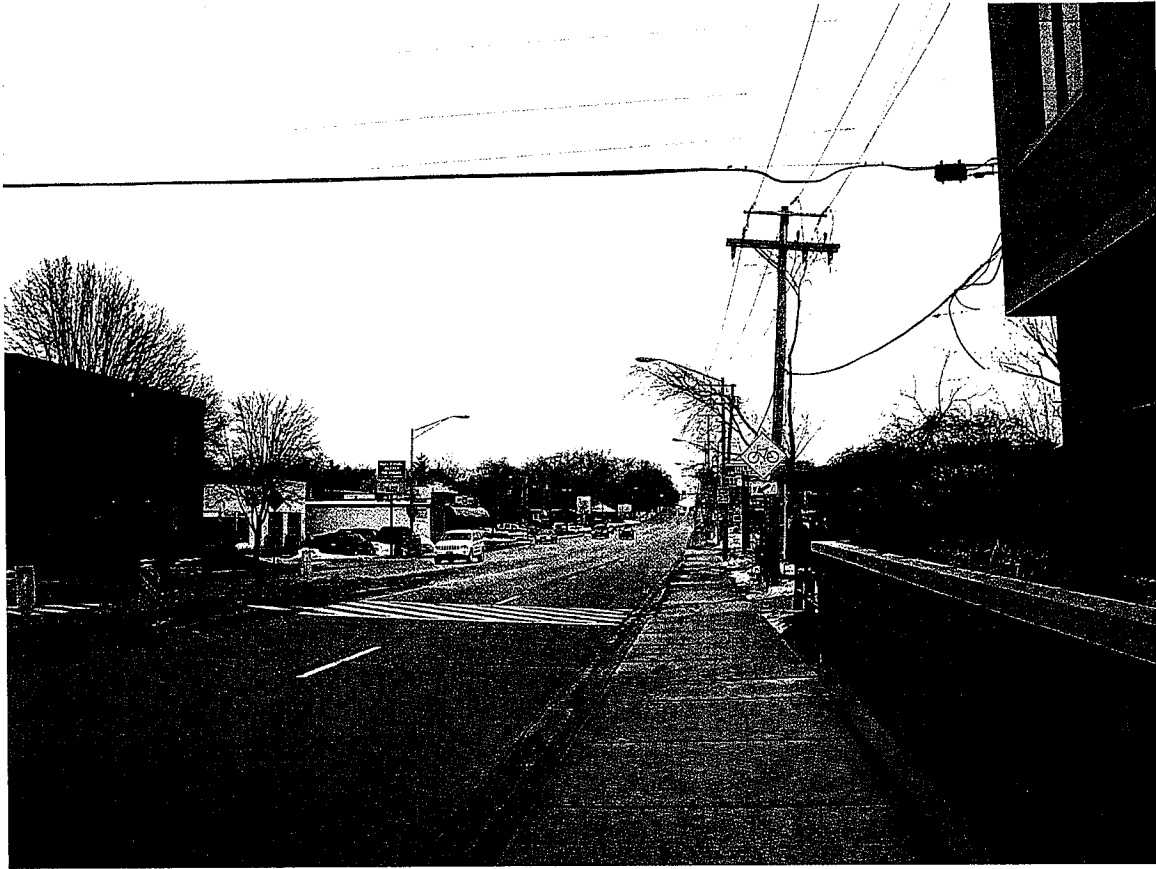
Main Street – looking south – Existing Condition