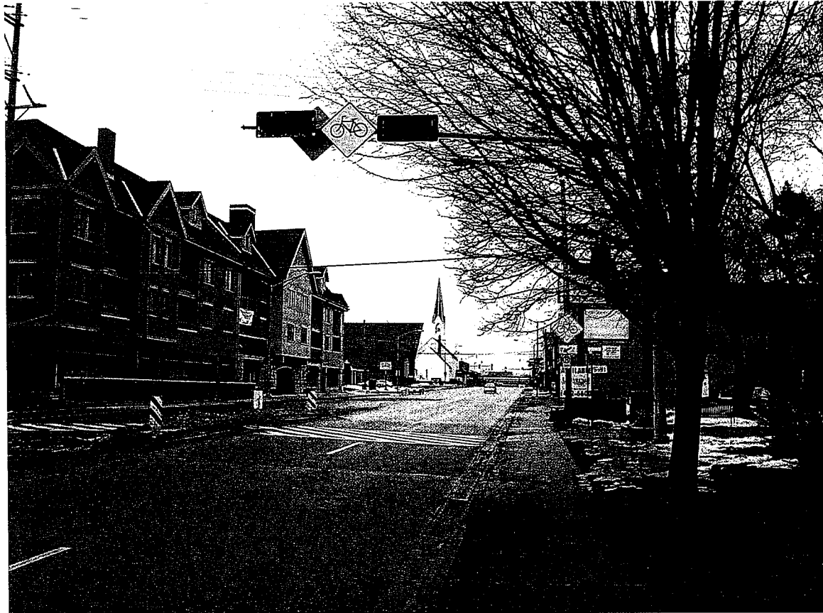
Main Street – looking north – Proposed Condition