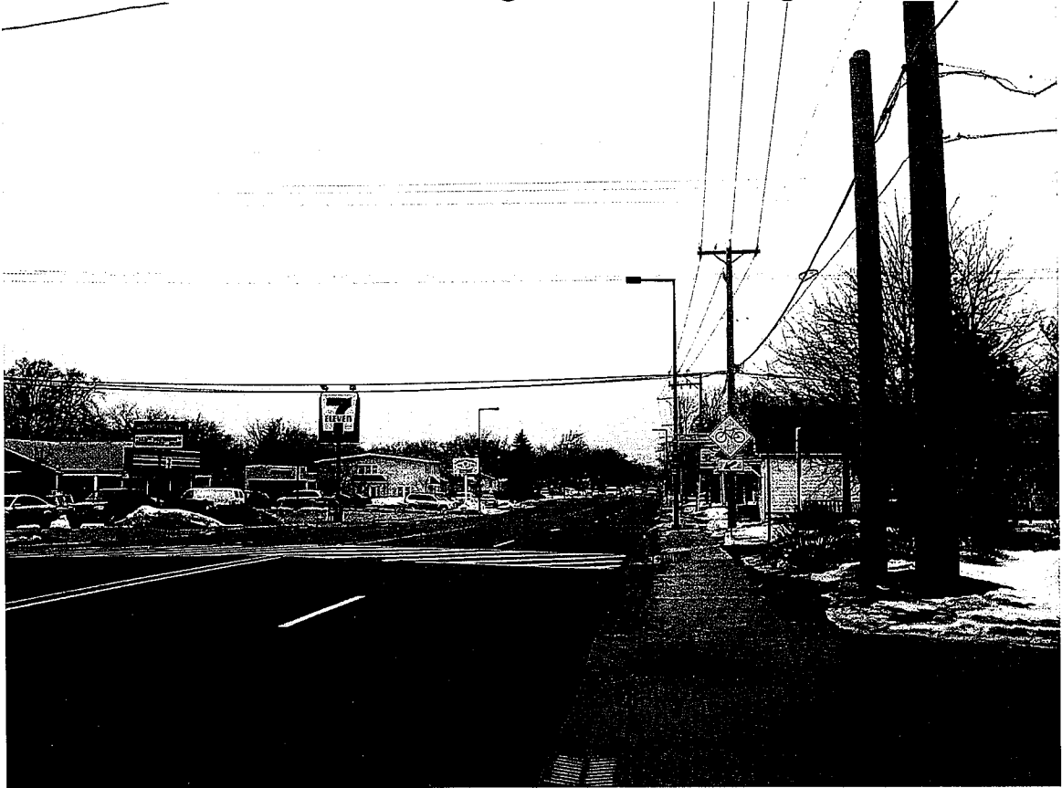
Westmore Road – looking north – Existing Condition