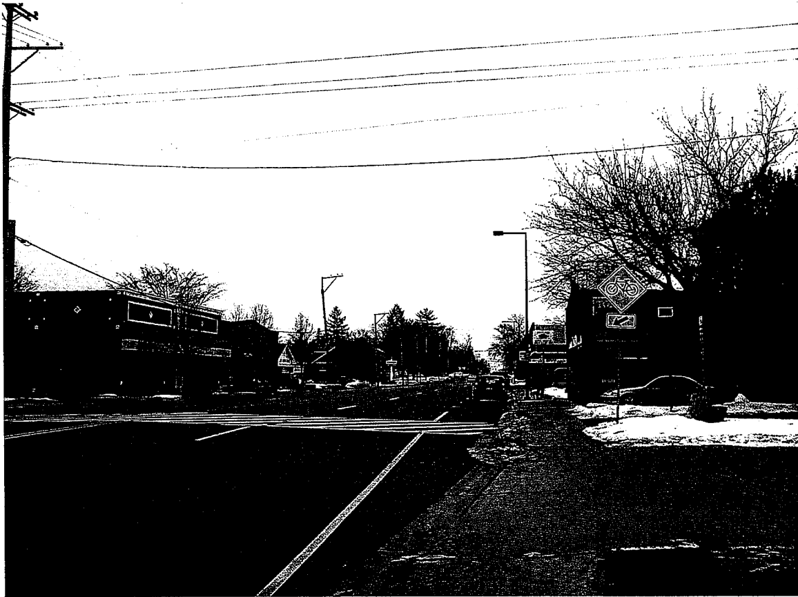
Westmore Road – looking south – Existing Condition