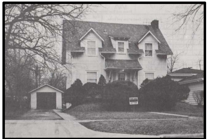
Figure 3 Historic view