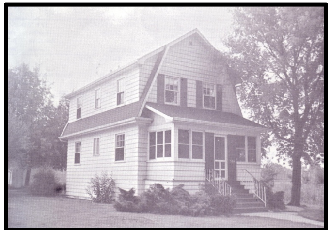
Figure 3 1961 View