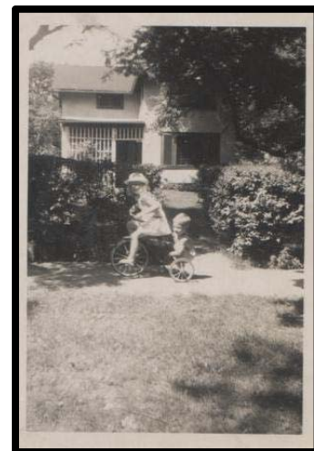
Figure 3 Circa 1950s view