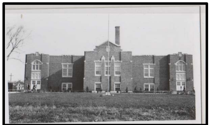
Figure 4 Historic view