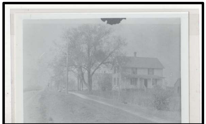
Figure Historical view