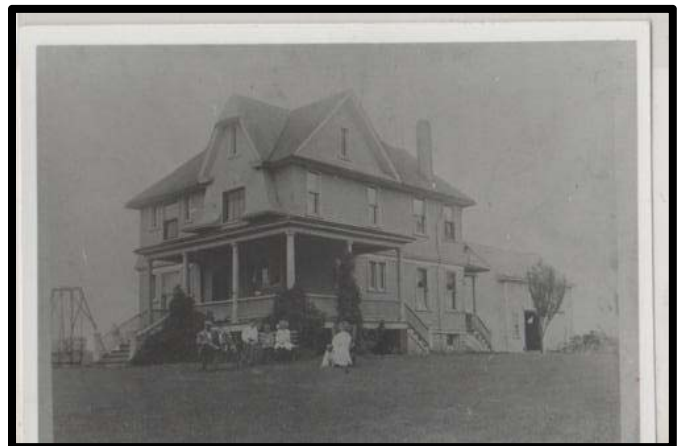
Figure 4 Historic view