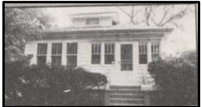
Figure 3 Historic view