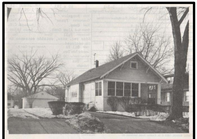
Figure 4 Historic view