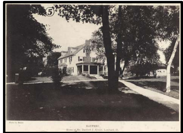
Figure 2 Historic view

The Abrams sold it to Roy & Ethel Spalding in 1923. The Spaldings owned it until the mid-1950s. It is likely that the house was clad with stucco & then brick by the Spaldings or shortly thereafter.