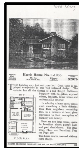
Figure 3 View of Harris Brothers catalog E-1033