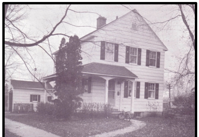
Figure 4 Historic view