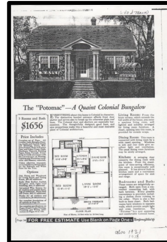
Figure 2 Ad for Montgomery Ward "Potomac" kit house

More research is needed on the original owner.