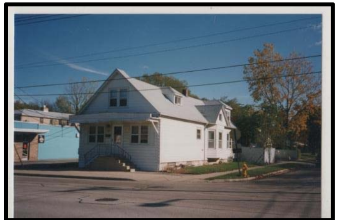
Figure 3 Older view