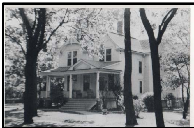
Figure 4 Historic view