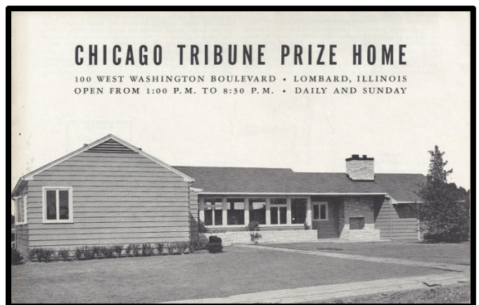
Figure 4 Historic image