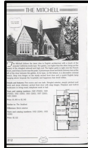
Figure 2 Sears "Mitchell" catalog ad