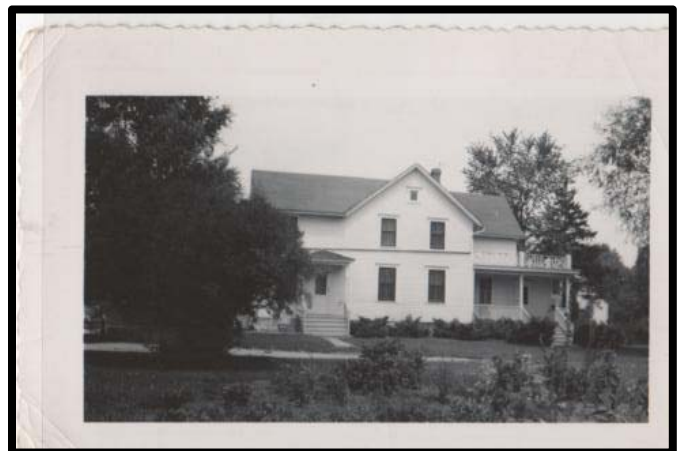
Figure 3 Historic view