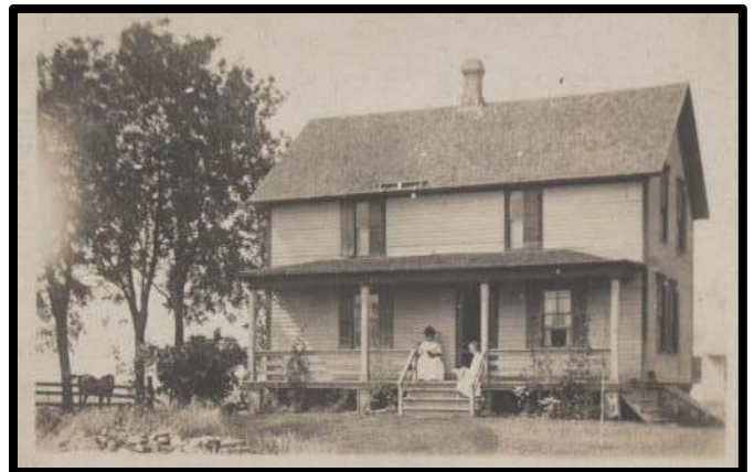
Figure 3 Historical view