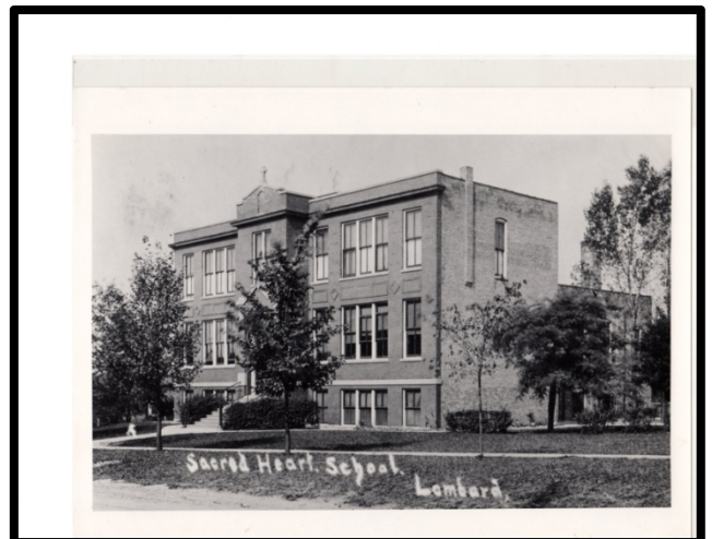
Figure 4 Historic view