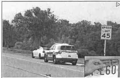
Lombard, IL: Drivers With No Tickets In 1 Year Should Read This